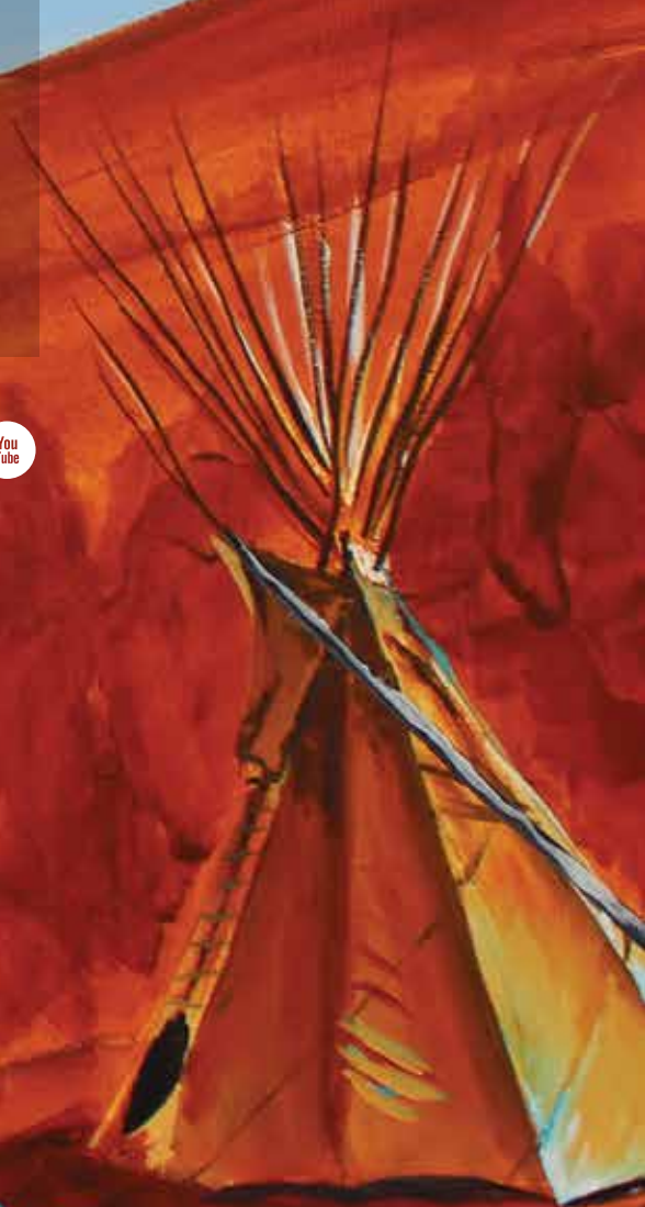
Illustration by artist Keegan Starlight