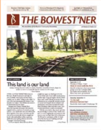
September/October Issue of the Bowest'ner

Respondents to the Bowness Vital Signs survey expressed concern about how difficult it was to find out what was going on in the community. By providing a revitalized Bowest'ner, the Bowness Community Association has taken action on this issue. The first edition of the new Bowest'ner appeared in residents' mailboxes in early July and was warmly received, judging from the positive feedback. Subsequent issues will be published and delivered bi-monthly. Between publications, the BCA will provide its members with updates via email; the first of these email newsletters went out in early October. The official website of the BCA ( www.mybowness.com ) is also designed to keep residents current with what's happening in the community.