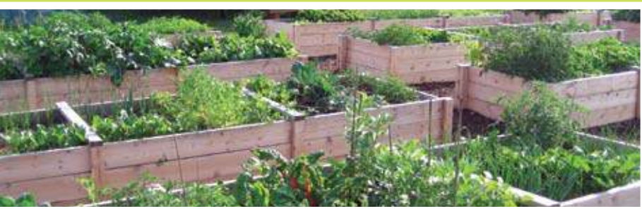
Bowness Railway Community Garden