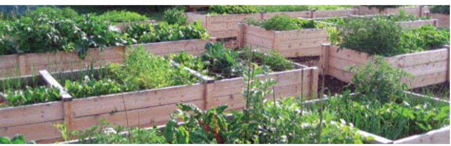
Bowness Railway Community Garden