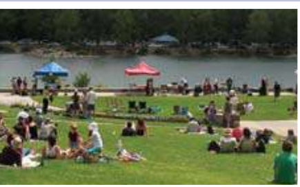
Picnickers enjoy sun and great music in Baker Park

A bit of rain didn’t dampen the fun for those at the second Annual Bownesians’ Picnic on July 18, 2010 at Baker Park. This year’s picnic grew from the first one held in August 2009. Approximately 900 guests came throughout the day, with around 500 picnickers on the hillside during its peak. Seven bands played to the appreciative crowd, including the host band and event organizer, The Bownesians. Local youth appeared between the main acts to entertain with their amazing guitar and fiddle reels.