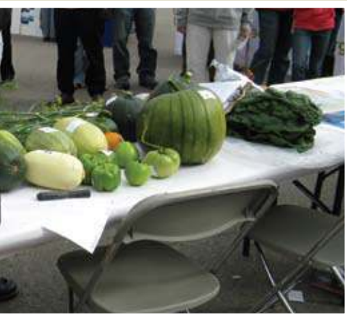
Produce from the Harvest Fair

in organizing the fair, which included a produce swap and sessions on canning and preserving, fermenting food, and apartment gardening. Information was also provided on community gardening, garden matchmaking and guerrilla gardening. Organizations that support growing food locally were on hand to talk about their services. Children enjoyed crafts, old-fashioned races, and creating mini greenhouses, which hopefully will inspire them to develop green thumbs and continue to participate in future Bowness Harvest Fairs.