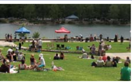
Picnickers enjoy sun and great music in Baker Park

A bit of rain didn’t dampen the fun for those at the second Annual Bownesians’ Picnic on July 18, 2010 at Baker Park. This year’s picnic grew from the first one held in August 2009. Approximately 900 guests came throughout the day, with around 500 picnickers on the hillside during its peak. Seven bands played to the appreciative crowd, including the host band and event organizer, The Bownesians. Local youth appeared between the main acts to entertain with their amazing guitar and fiddle reels.