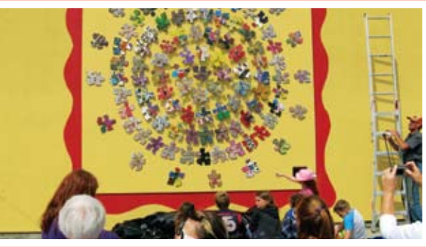
'Community Belongings', created by local youth