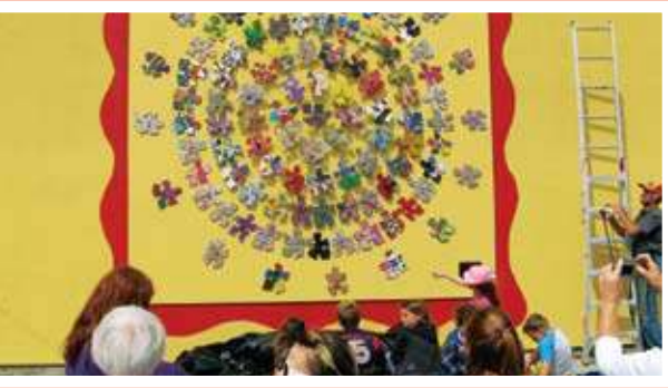
'Community Belongings', created by local youth