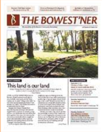
September/October Issue of the Bowest'ner

Respondents to the Bowness Vital Signs survey expressed concern about how difficult it was to find out what was going on in the community. By providing a revitalized Bowest'ner, the Bowness Community Association has taken action on this issue. The first edition of the new Bowest'ner appeared in residents' mailboxes in early July and was warmly received, judging from the positive feedback. Subsequent issues will be published and delivered bi-monthly. Between publications, the BCA will provide its members with updates via email; the first of these email newsletters went out in early October. The official website of the BCA ( www.mybowness.com ) is also designed to keep residents current with what's happening in the community.