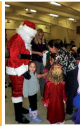
Bownesians enjoy a holiday celebration.

Despite the cold and snowy weather on December 5, 2009, a total of 360 community residents attended the First Annual Bowness Christmas Party. Fifty volunteers served turkey dinner complete with all the trimmings. Inspired by the Bowwest Community Resource Centre, the event was put together by a planning committee of members from seven local agencies, and the Bowness Community Association provided part of the funding. A highlight for many was the entertainment, with local youth sharing their musical talents. Santa Claus made an appearance after the dinner and provided treats for the 140 children in attendance. Attendees praised the wonderful community atmosphere of the event, and everyone agreed that this Community Christmas Party should become an annual event in Bowness.