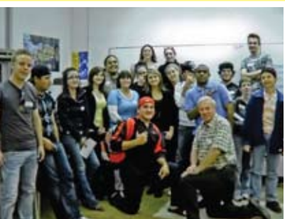
Never Too Late Graduating Class of 2011

According to 2006 federal census results, 26 per cent of Bownesians aged 15 years and over held no certificate, diploma or degree, while the citywide rate was 18 per cent. For this reason, Bowness is fortunate to have a program called Never Too Late, which helps adults living in Bowness and nearby communities complete their Grade 12 Equivalency Diploma (GED).