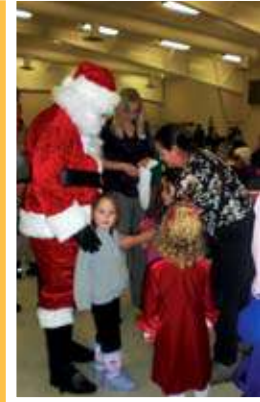
Bownesians enjoy a holiday celebration.

Despite the cold and snowy weather on December 5, 2009, a total of 360 community residents attended the First Annual Bowness Christmas Party. Fifty volunteers served turkey dinner complete with all the trimmings. Inspired by the Bowwest Community Resource Centre, the event was put together by a planning committee of members from seven local agencies, and the Bowness Community Association provided part of the funding. A highlight for many was the entertainment, with local youth sharing their musical talents. Santa Claus made an appearance after the dinner and provided treats for the 140 children in attendance. Attendees praised the wonderful community atmosphere of the event, and everyone agreed that this Community Christmas Party should become an annual event in Bowness.