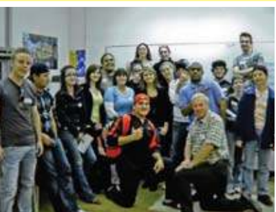
Never Too Late Graduating Class of 2011

According to 2006 federal census results, 26 per cent of Bownesians aged 15 years and over held no certificate, diploma or degree, while the citywide rate was 18 per cent. For this reason, Bowness is fortunate to have a program called Never Too Late, which helps adults living in Bowness and nearby communities complete their Grade 12 Equivalency Diploma (GED).